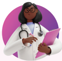
All Primary Care Visits