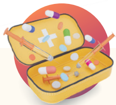
Type 2 Medications

100% COVERAGE MEANS YOU COULD PAY NOTHING FOR