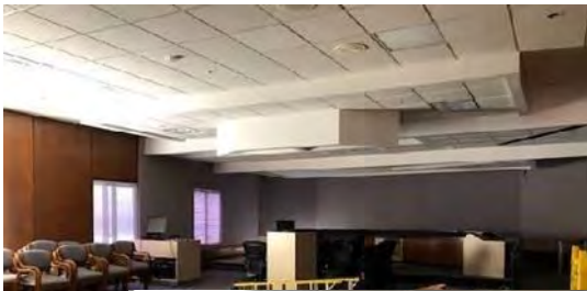
Council Chambers Then (Left) and Now (Right)