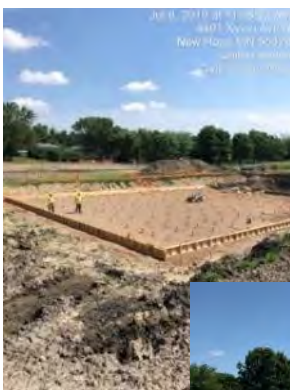
(Clockwise from Top Left) Then: Footings for 50-meter pool, Footings for Theatre; Now: Theatre, 50-meter pool filled