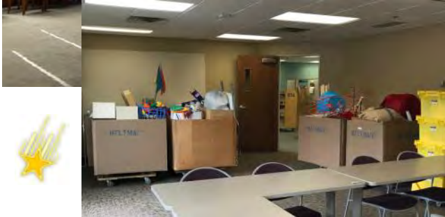
Work Session Room Then (Left) and Now (Right)