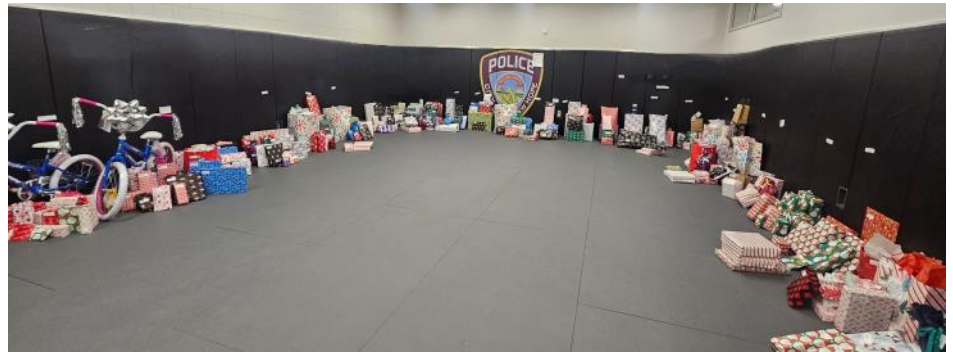
Blue Santa 2024

The police department hosted 10 families for the annual Blue Santa event, wrapping 501 presents!