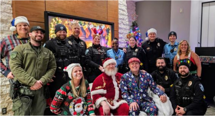
Blue Santa 2024