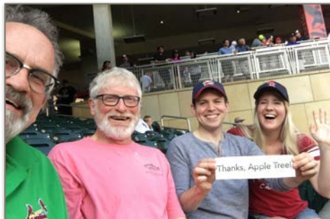
Submitted by Carl Peterson