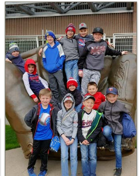
Submitted by Amanda Siem (MA)

Thanks again to everyone who participated in the Summer Photo Contest and to everyone who sent in Twins photos. And remember: staff can send in photos and stories to the Branch at any time!