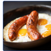
Breakfast Sausage and Eggs