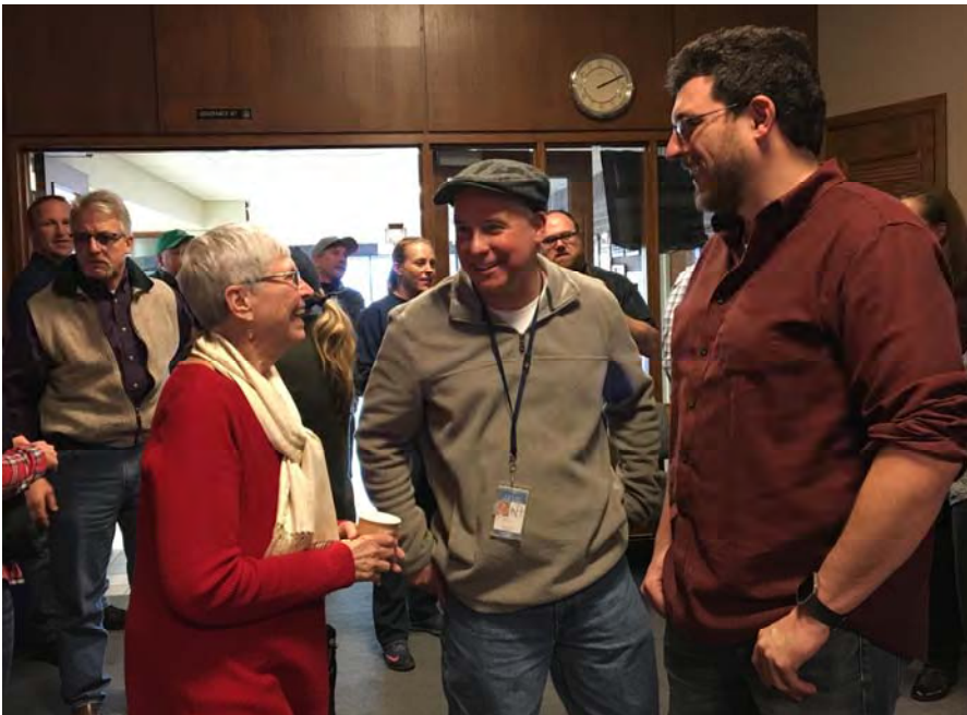
The retiree-to-be had a bit of advice for us!