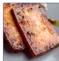
Spicy Tofu and Vegetables