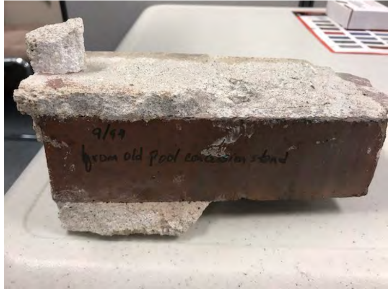
Brick from Pre-1999 Pool Concession Stand