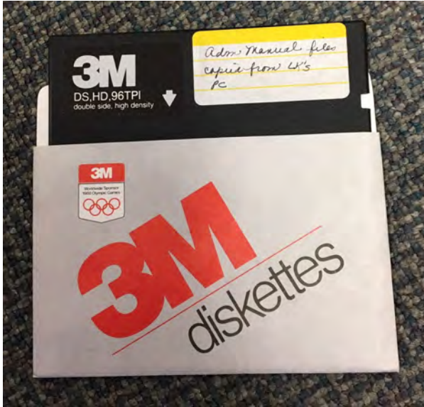
5 1/4 Floppy Disk

As announced earlier in the year when we held the first reducing day at city hall, we asked staff to submit items that they were disposing of that might be a bit unusual in some way. Here are the items submitted that are the oldest, funniest, craziest, etc.. items they disposed of. Please take a moment to go to surveymonkey and cast your ballot. https://www.surveymonkey.com/r/5QY8CBK Winners will be announced in the next edition of News & Views .