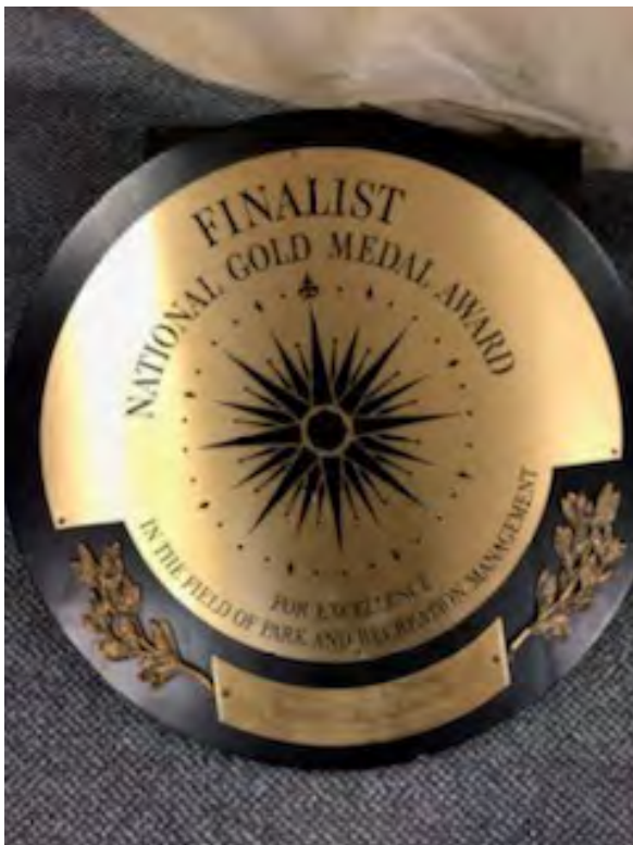
National Gold Medal Finalist Award