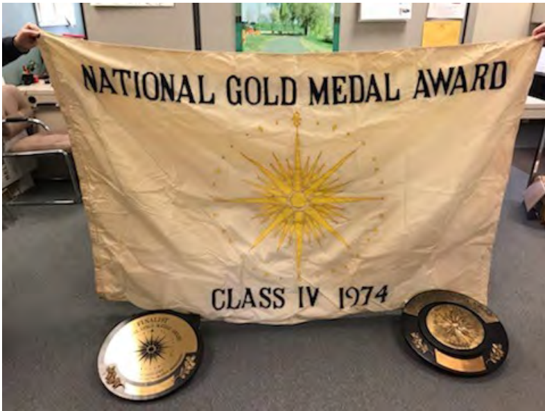
National Gold Medal Winner Award